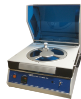
UH114 tape mounter